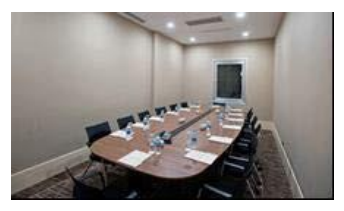
Sivriada Hall- Tavşan Adası Hall-Sedef Adası Hall- Yassı Ada Hall-Kınalı Ada Hall